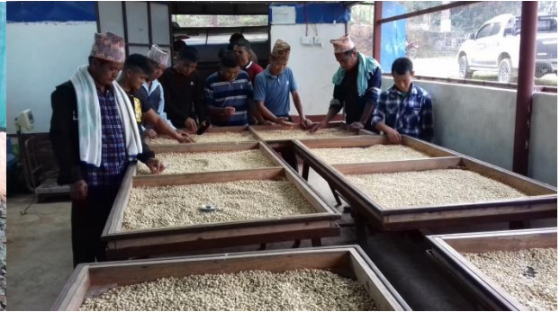
Coffee Nursery & pulping center observation