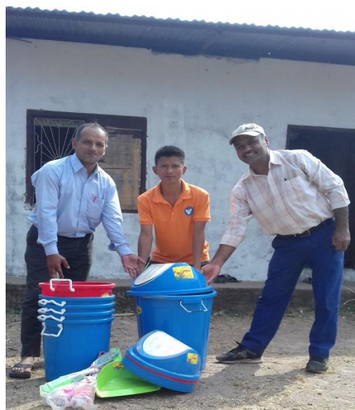
Dust bin & sanitary materials Handover to schools Dhoubadi & Charghare.