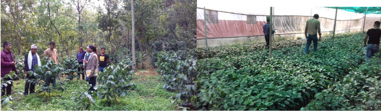
Coffee garden & Nursery observation in Pokhara.