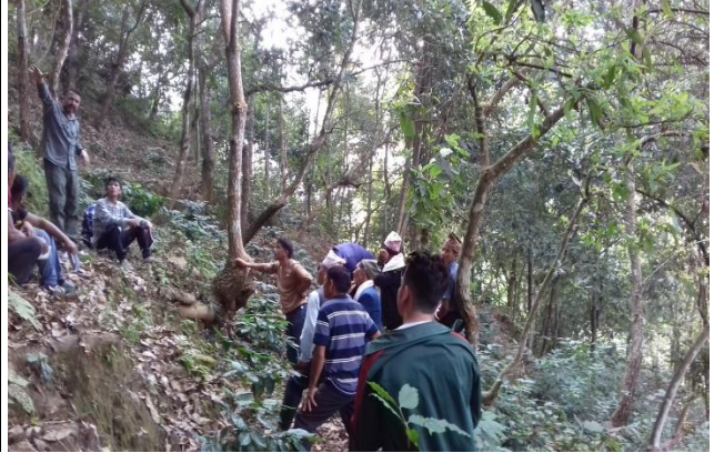
Coffee garden observation , Gorkha