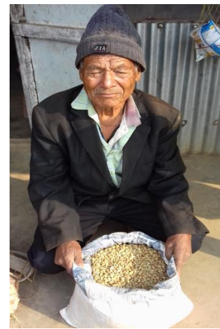
Coffee parchments ready for sell & sold at doorstep