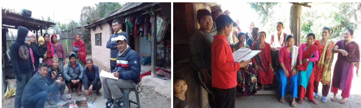
Farmers groups Meetings in Dhoubadi and Charghare

Farmer groups meetings & follow-up is a continuous activity of the project. We sit together, discuss & decide with farmers on newly implementing activities before its implementation in the project site. We also review & go through the implemented or conducted activities in these meetings. During this period we conducted 7 meeting of farmers groups. There were 203 (80F 123 M.) participants in 7 farmers' groups meetings. In this meeting we discussed & decided/planned about the farmer's exposure visit, the Training of coffee farming & cultivation, date, venue, participation and selection of farmers for tunnel farming & HDPE tank distribution, coffee cherry picking, pulping, parchment preparation, marketing and selling. As the decision of the meetings, we were able to conduct exposure visit, coffee cultivation training on time with active participation of farmers. As a result, farmers are picking & pulping coffee cherry, made parchment & sold on time as per the agreed plan. Farmers are identified/selected for tunnel farming & HDPE Tank distribution support. Newly planted coffee saplings are properly cared, watered and fertilized.