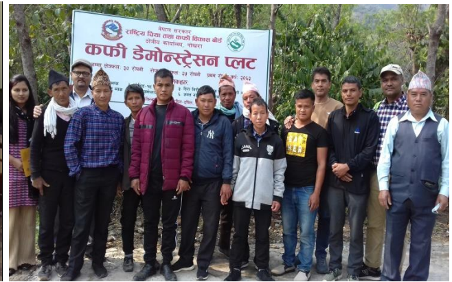
Tea & coffee development board, Pokhara