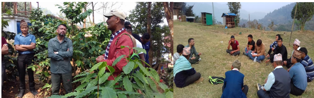
Discussion about the objective of visit at Gorkha coffee farm